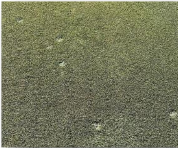
Unrepaired ball marks

Great golfing weather can be hard to come by throughout the winter months; sometimes it's just too cold! On these cold days, the turf has drastically slowed in growth, making it